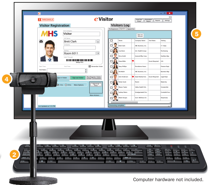
Computer hardware not included.