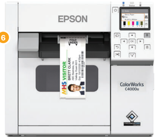
6 Epson® C4000 Color Printer