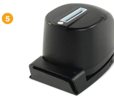
5 Gemalto Photo Driver's License Reader