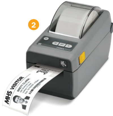
2 ZEBRA® Direct Thermal Printer