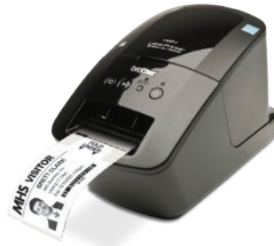
Brother QL Series

For more information check with printer manufacturer.