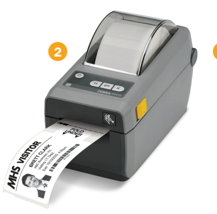
ZEBRA® Direct Thermal Printer