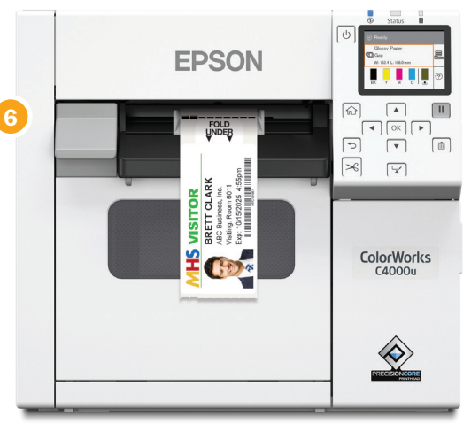
EPSON<sup>®</sup> Colorworks C4000 Matte Inkjet Printer