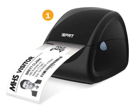
IDPRT<sup>®</sup> Direct Thermal Printer