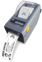
Zebra® Model # ZD410