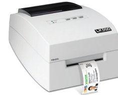
Primera® Color Label Printer Model #'s LX 500 and LX 400