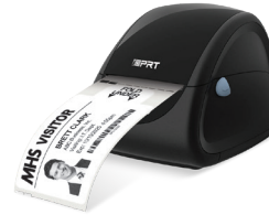
IDPRT® Model # SP310