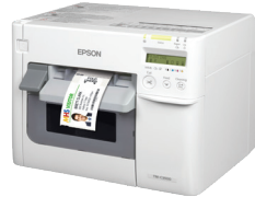
Epson® Color Inkjet Model #'s C4000 Matte and C3500