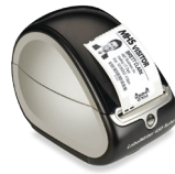
DYMO® Model #'s 450 and 450 Turbo (not DYMO 500)