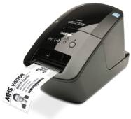
Brother® Model # QL-720NW and other QL series printers