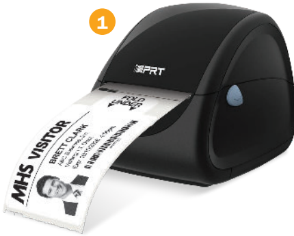
IDPRT® Direct Thermal Printer