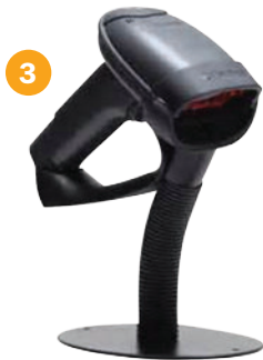
Turbo Driver's License Scanner