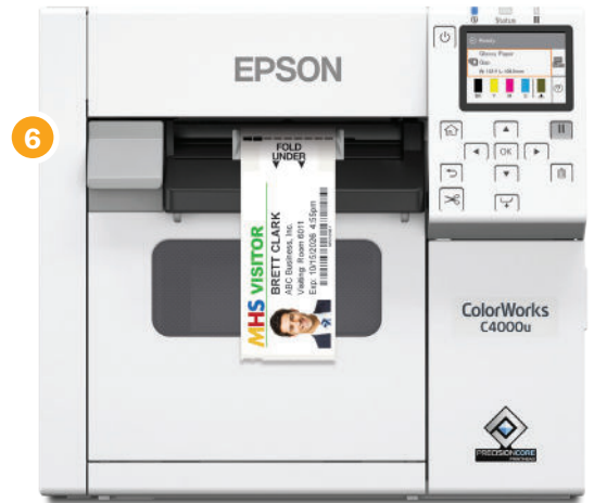
EPSON® Colorworks C4000 Matte Inkjet Printer