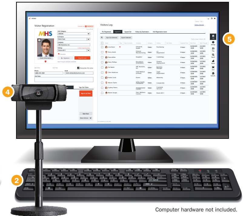
Computer hardware not included.