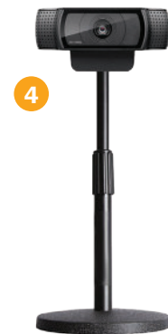
Logitech® Camera with stand

Choose the Expiring badge style that is best for you.